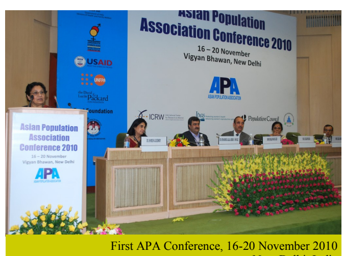
New Delhi, India

The conference drew nearly 400 participants from 29 countries - mostly Asian but a few research scholars working on Asia but living in countries like the US, UK, Germany, Netherlands, also attended the conference. In all, 14 themes were identified and internationally renowned experts were requested to select abstracts pertinent to each of the themes and create sessions and identify chairs and discussants for the sessions. The APA had received, in response to a call for submission of abstracts, nearly 700 abstracts. Based on this, 230 papers were presented in 58 sessions. Also, nearly 150 posters were presented over three days. The presence of many young demographers from across Asia who experienced the stimulating environment and high quality of the conference was noticeable.